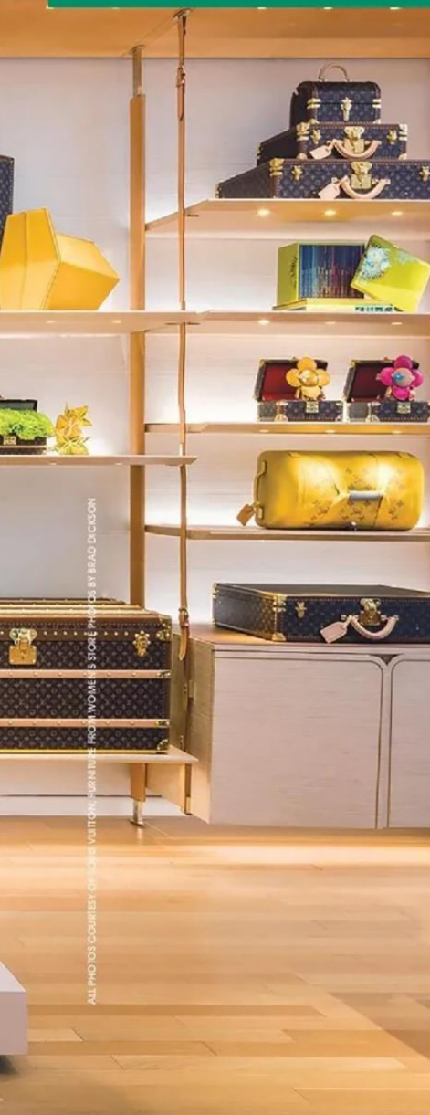
FURNITURE FROM WOMEN'S STORE.