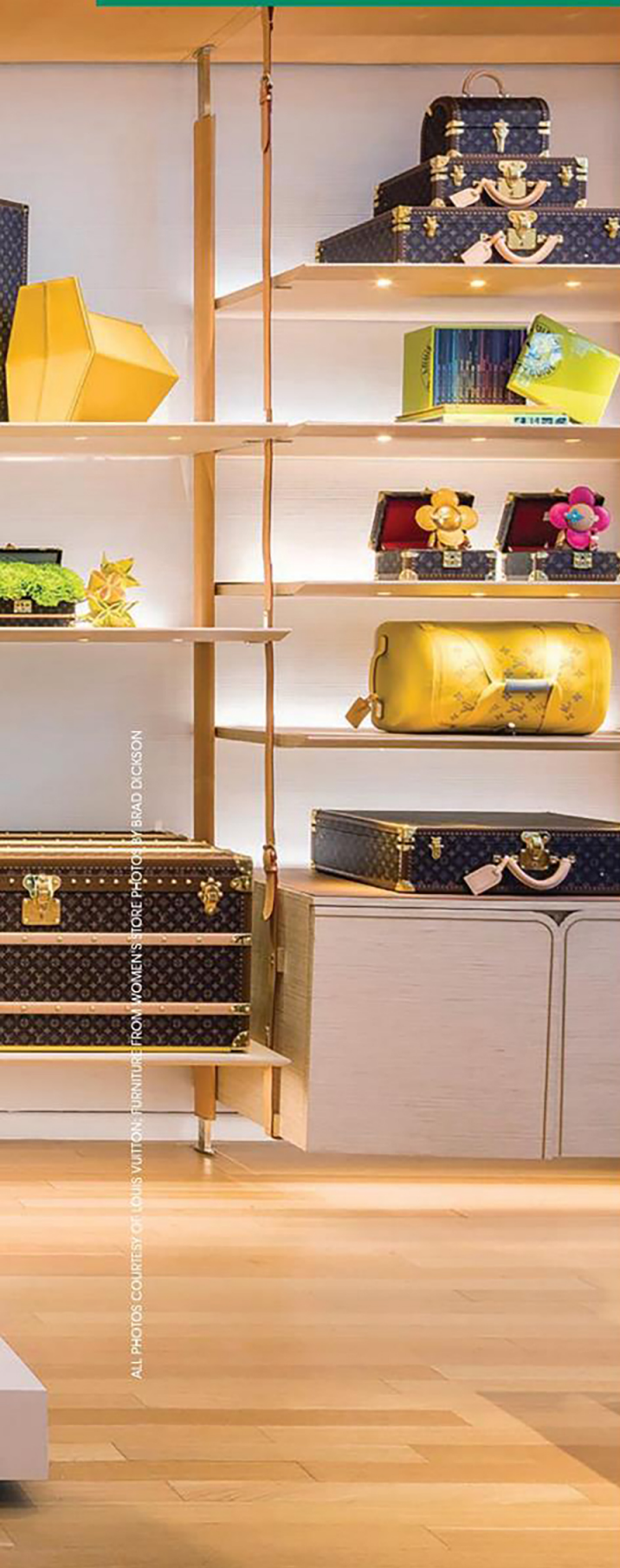
ALL PHOTOS COURTESY OF LOUIS VUITTON; FURNITURE FROM WOMEN'S STORE PHOTOS BY BRAD DICKSON

Chinese designers generally have two missions. The first is to promote Chinese design as it moves from developing to developed, by not only supporting the design industry but also by popularizing design to the general public. The other is to find ways to pave the way for our native culture's modern and future design. ■