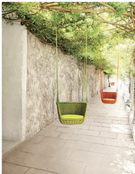
Paola Lenti's Adagio suspension chairs