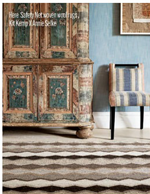
Here: Safety Net woven wool rugs, Kit Kemp X Annie Selke