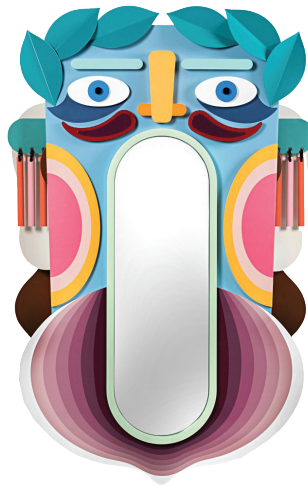
Grifo cabinet by Elena Salmistraro for altreforme imaestri.com