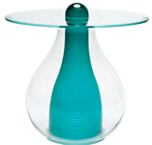
MIYA table by Elena Salmistraro for Cappellini artemest.com