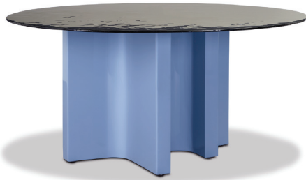
Dharma table by Studiopepe for Baxter baxter.it