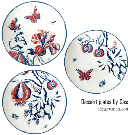
Dessert plates by Casa Branca casabranca.com